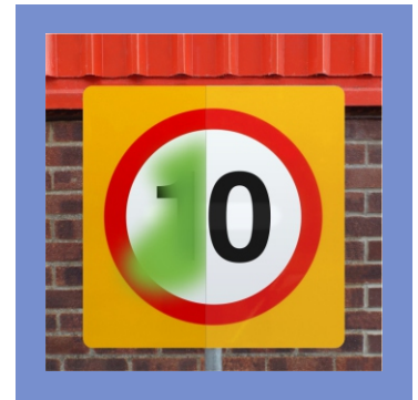
Dry wipe applied to right side of sign

Our highly effective dry-wipe over-laminate is also scratch resistant and will block 98% of UV rays, therefore preventing fading.