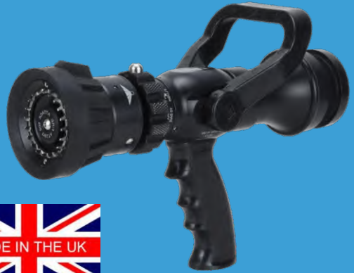
Attack 500-Pro Series Nozzle