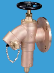
Pressure Regulating Valves